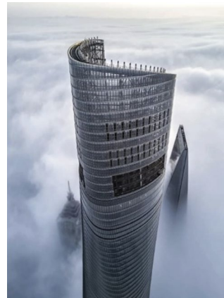
The Void in Modern Times